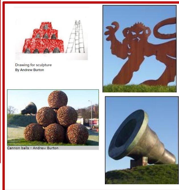
Drawing for sculpture By Andrew Burton