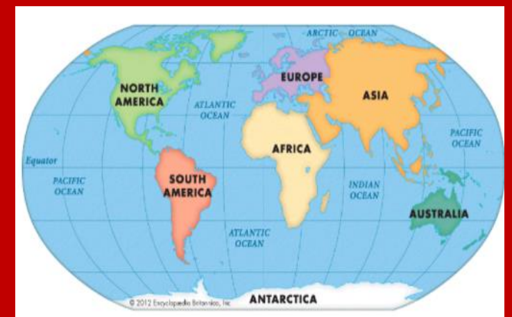
The 7 continents of the world.