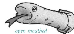
open mouthed sock puppet