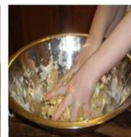
Rubbing in to mix fat and flour if making a yeast-based product