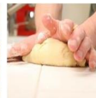
Kneading a bread dough