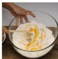
Mixing to combine ingredients if making savoury muffins or scones