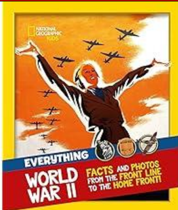
Everything WWII – National Geographic Kids