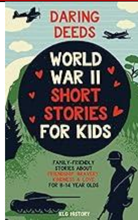
Daring Deeds - World War II Short Stories for Kids: Family-Friendly Stories About Friendship, Bravery,